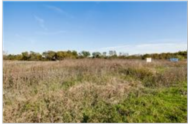
105 Louise Ritter Blvd