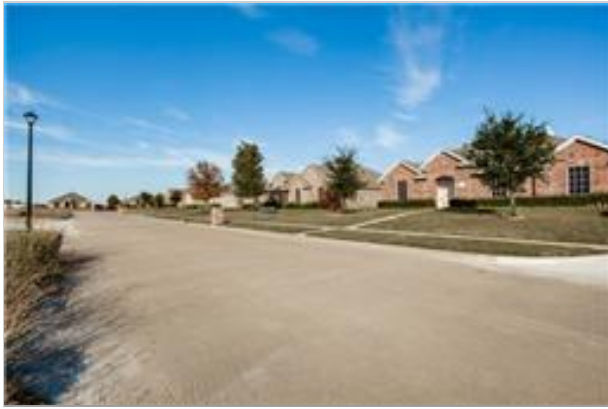
105 Louise Ritter Blvd