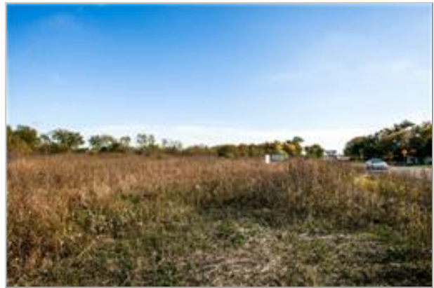
105 Louise Ritter Blvd