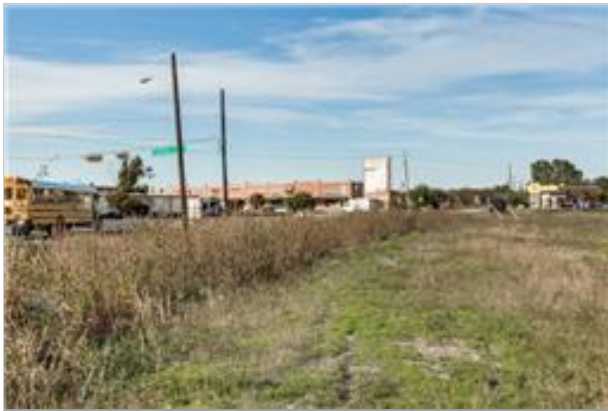
105 Louise Ritter Blvd