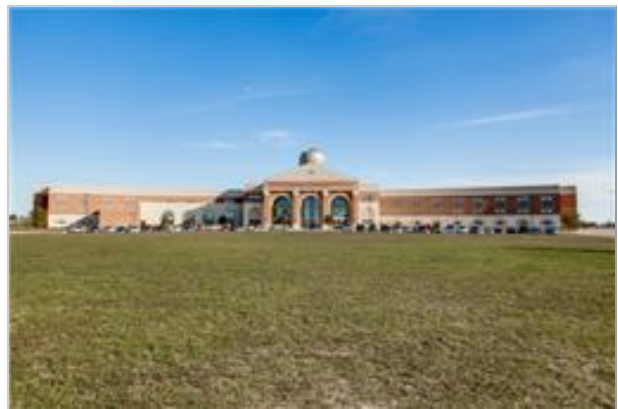
105 Louise Ritter Blvd