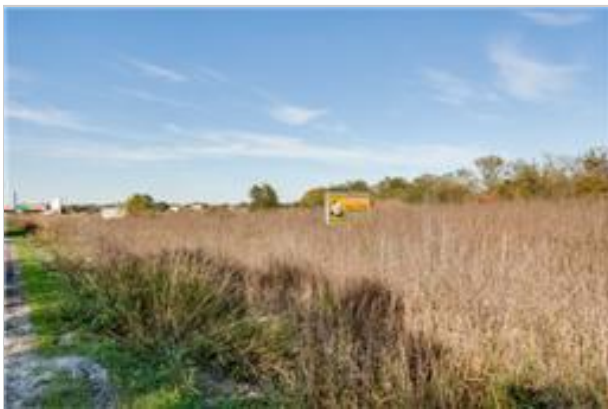
105 Louise Ritter Blvd